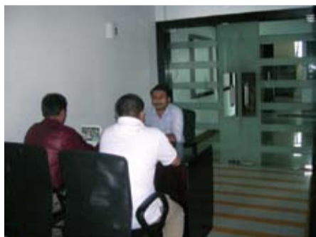
Exclusive Travel Desk has started functioning close to the Lobby. Now guests can get services of the Travel Desk round the clock.